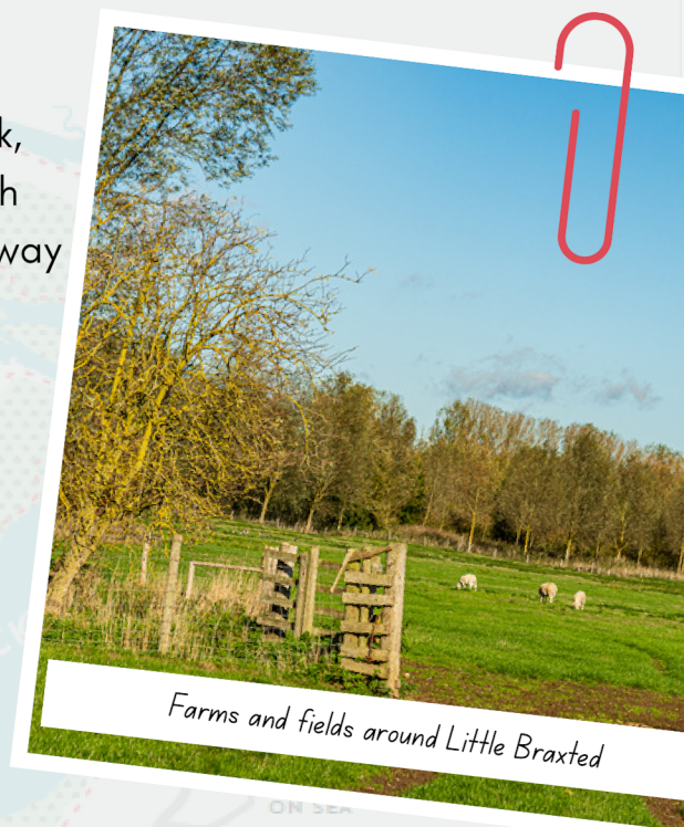
Farms and fields around Little Braxted