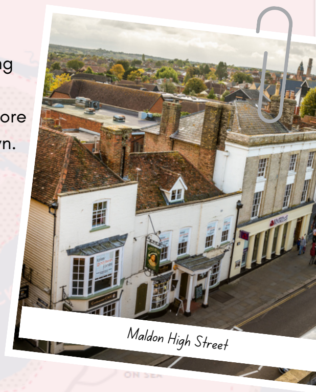
Maldon High Street