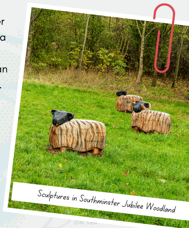
Sculptures in Southminster Jubilee Woodland