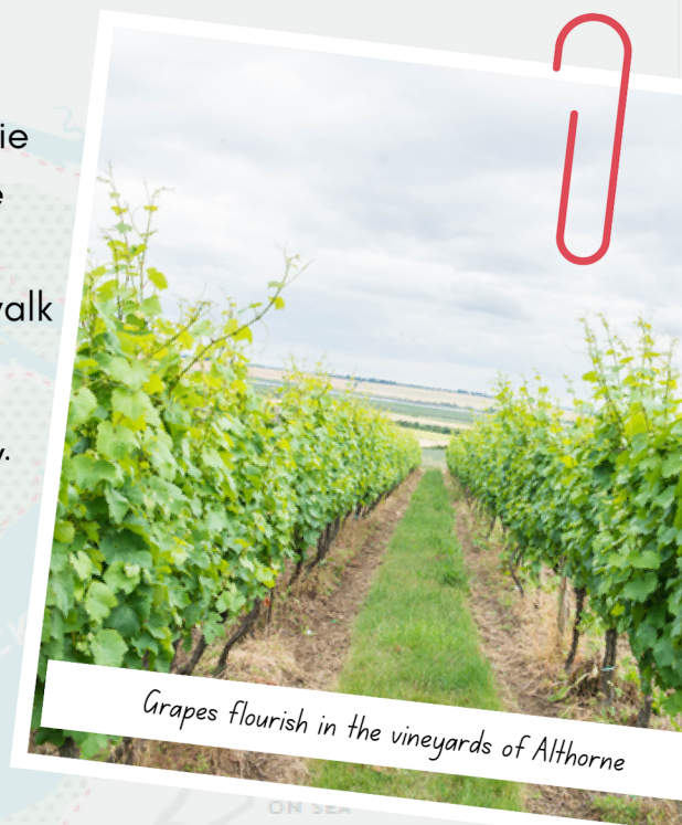
Grapes flourish in the vineyards of Althorne