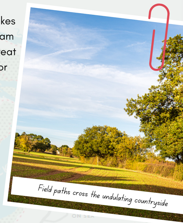
Field paths cross the undulating countryside