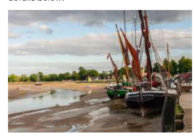
Discover a slice of the real Essex Coast in the Maldon District.

If you spot something and would like to share it with us, please get in touch using the details below!