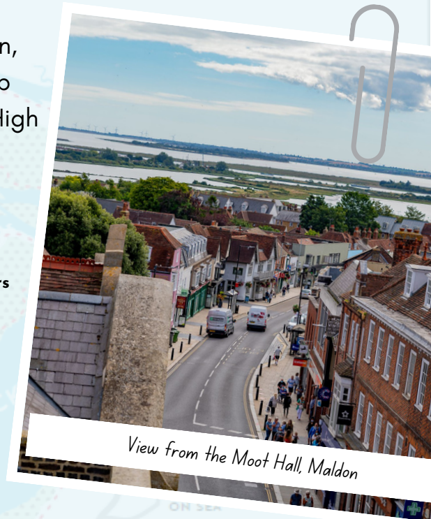
View from the Moot Hall, Maldon