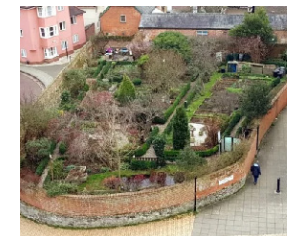
Friary Walled Garden: Maldon & Heybridge Horticulturay Society

Maldon's secret garden is guaranteed to surprise everyone who encounters it for the first time. This unexpected green oasis hides behind ancient red brick walls. Through the wooden entrance door, you will find a lovingly restored garden with narrow footpaths and box hedges. It is thought that the site was cultivated as far back as the 13th century when it was occupied by a Carmelite monastery. It is usually open on the first Sunday of every month.