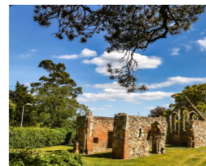
St Giles' Leper Hospital: Adrian Day (2020)

St Giles's Leper Hospital is one of Maldon's best kept archaeological secrets. The chapel was founded to provide services to the lepers and became a general hospital for the poor and infirm. It was connected to Beeleigh Priory and later served as a farm building for many centuries until work commenced to restore the ruins in the 1920s. Most of the existing structure dates from the 12th Century and contains Roman bricks.