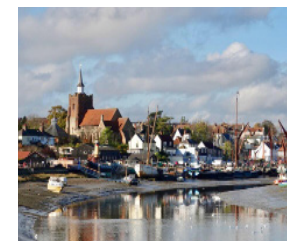
River Blackwater: Stanley Brett (2017)

The original tower of St Mary's Church was built in 1300 and served as a navigation aid on the River Blackwater during the medieval period. A beacon fire was lit at the top of the tower to guide ships to shore. The tower was so important to navigation that when it collapsed in 1605, the town petitioned King James I to rebuild it, but the rebuilding was not complete until 1638. Later in 1740, the shingled spire was added, and this still serves as an aid to navigation on the river.