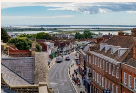
Maldon High Street